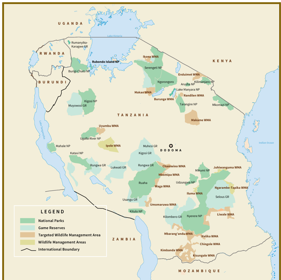
Figure: Protected areas of Tanzania (including WMAs)

Authorized Association), WMA management teams, village game scouts, anti-poaching units, private investors, partner NGOs and social enterprises as well as relevant government stakeholders. Proving that community-based conservation (CBC) & community-based natural resource management (CBNRM) can be successful approaches to environmental challenges by showing that the WMA model can produce both ecological and social benefits for wildlife and people is what we are working towards. Our vision is that communities and wildlife in Tanzania will benefit from coexistence and thrive for generations to come.